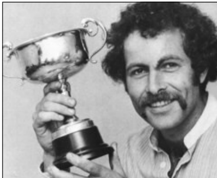
1981 NZ Player of the Year